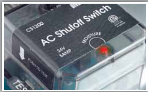
LED Indicator Light

Hinged clamp bar self adjusts to angle of pan wall for a level switch. One-step installation with single screw fastener. Single screw fastens switch to pan – no drilling and no fussing with multiple thumb screws.